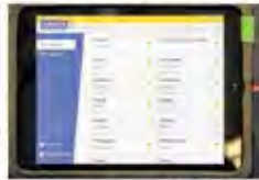
An iPad connects to interpreters who can assist in dozens of languages, including American Sign Language.

In a bid to boost County's efforts — to give those a total of 47 million residents an easier