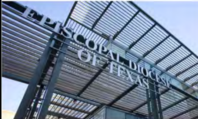
Episcopal Diocese of Texas HQ